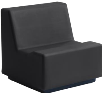
901 | Black