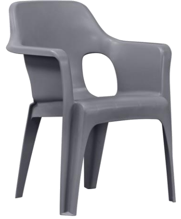
5000-20-845 Flannel Grey