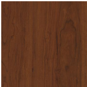
LIGHT CHERRY | LC Formica 6208-58 Glamour Cherry Oak