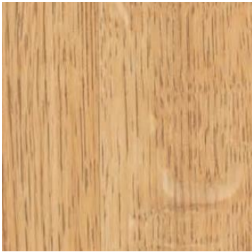
LIGHT OAK | LO Formica 7152-58 Northern Oak