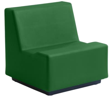
220 | Leaf