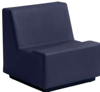
403 | Huckleberry