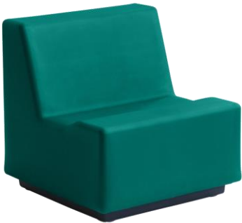
225 | Splash