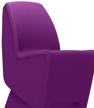
360 | Grape