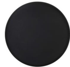
Black | BK

Bases – for 450 Seclusion Beds and 520 Lounge Seating