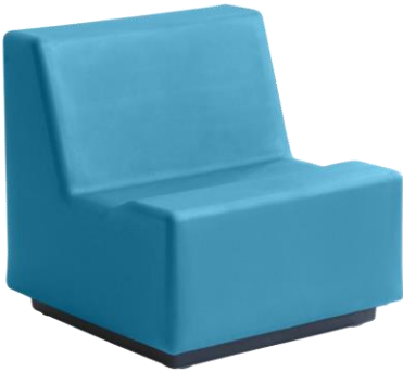
210 | Sky

NOTE – Colors listed below are for ModuForm’s molded and flexible vinyl products found in: 350 Series Rockers Grade 7 & 9 Cushions, 450 Series Seclusion Beds, 520 ModuForm lounge, 800 Series ModuBlock Grade 7 & 9 Cushions, 810 Series ModuEsque Grade 7 & 9 Cushions and 3000 Beam Seating. Please contact Customer Service at 800-221-6638 for more information.