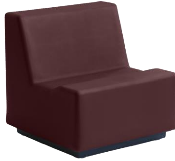
318 | Burgundy*