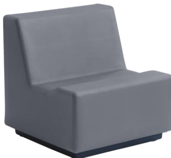
845 | Flannel Gray*