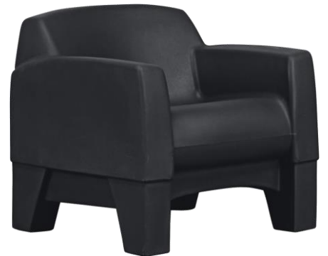
901 | Black*