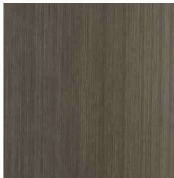
STONE | ST Formica 6413-58 Silver Riftwood Oak & Maple