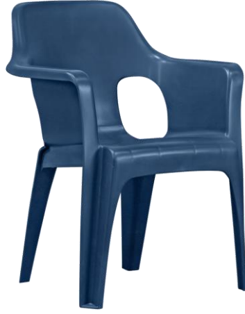
5000-20-426* Slate Blue