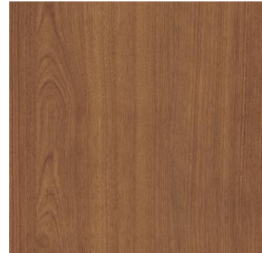
LIGHT CHERRY | LC Formica 5904-58 Wild Cherry Maple