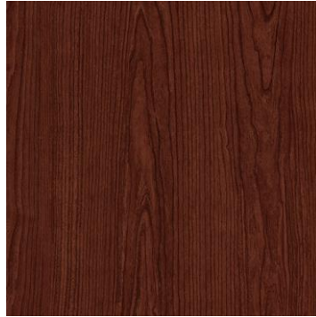
CHERRY | CO Formica 7759-58 Select Cherry Oak & Maple