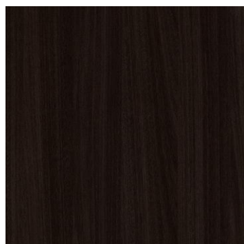
DARK MOCHA | DM Formica 8848-58 Blackened Legno Oak & Maple