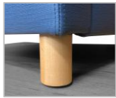
Wood Cylinder Leg