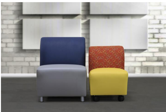
SF6201 Chelsea on left vs SF6201J on right SF6201: 29"d x 24.5"w x 32"h | 18" sh SF6201J: 25"d x 18"w x 27"h | 15" sh

Chelsea Jr.'s frame components are machined into puzzle like pieces on state of the art CNC equipment to within the tightest of tolerances. During the assembly process, these components lock together while commercial adhesives and mechanical fasteners are introduced to further enhance the construction. This process results in the most durable, robust and stable foundation from which to build upholstered furniture. Sinuous wire springs are added, tied together and connected to tape lined clips which prevent squeaking. This improves the longevity and overall strength. Foam is commercial grade for comfort and resiliency. Fabric is upholstered to the frame with precision for a tailored fit and finish.