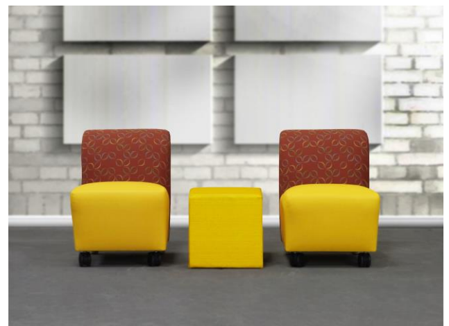
SF6201J Chelsea Jr. with BCE3X15V Bounce in center SF6201J: 25"d x 18"w x 27"h | 15" sh BC3X15V: 15"d x 15"w x 15"h (pressure foam filled)