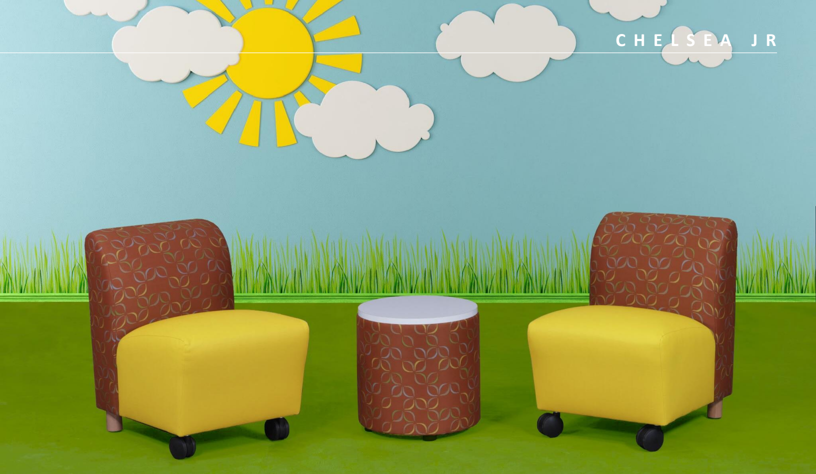
SF6201J Chelsea Jr Chair | BG8516HT Dalton Jr with Writable HPL | SF6201J Chelsea Jr Chair

Chelsea Jr.'s frame components are machined into puzzle like pieces on state of the art CNC equipment to within the tightest of tolerances. During the assembly process, these components lock together while commercial adhesives and mechanical fasteners are introduced to further enhance the construction. This process results in the most durable, robust and stable foundation from which to build upholstered furniture. Sinuous wire springs are added, tied together and connected to tape lined clips which prevent squeaking. This improves the longevity and overall strength. Foam is commercial grade for comfort and resiliency. Fabric is upholstered to the frame with precision for a tailored fit and finish.