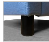
Metal Cylinder Leg | Black