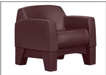
5000-250-318 | Burgundy 29.5"d x 29"w x 29"h 23.5" arm ht | 17.5" seat ht

Moduform rotationally molds a rigid, high-impact polyethylene that is sealed, seamless, puncture and fluid resistant. This provides a seating solution that is easy to keep clean as mild detergents, steam and bleach-based agents can be used to aid in the prevention of blood borne pathogens. The generous seat size allows for greater comfort, while the arms make it easy to sit or stand as they add support and safety to those who are seated. Units can be joined together to create banquette style lounge areas.