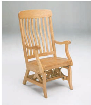
In Natural finish | ROC01-NB