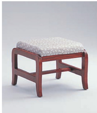
Ottoman | ROC05