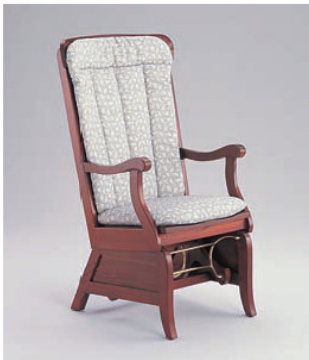
with Side Panels | ROC01SP

Olive's frame is constructed with solid beech components enhanced with mortise and tenon joinery, glued and screwed for durability. Patented sealed ball bearing mechanism produces a true rocking motion; not gliding. Solid seat with machined scoop for additional comfort. Optional seat and back cushions can be easily affixed. Available with side panels, locking mechanism and complimenting ottoman as shown below.