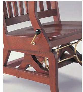
With Locking Mechanism