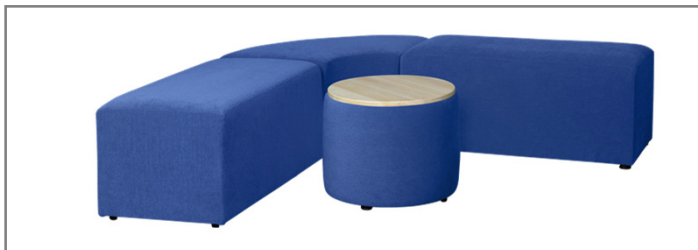
BG8509 | BG8508 | BG8509 | BG8505HT