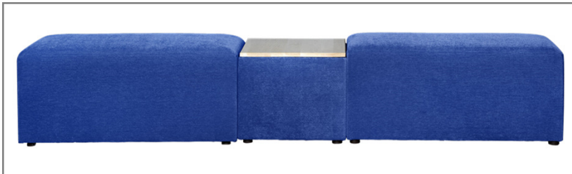
BG8509 | BG8502HT | BG8509

Dalton's frame components are machined into puzzle like pieces on state of the art CNC equipment to within the tightest of tolerances. During the assembly process, these components lock together while commercial adhesives and mechanical fasteners are introduced to further enhance the construction. This process results in the most durable, robust and stable foundation from which to build upholstered furniture. Foam is commercial grade for comfort and resiliency. Fabric is upholstered to the frame with precision for a tailored fit and finish.