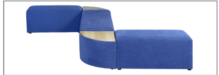
BG8509 | BG8501HT | BG8510 | BG85-1HT | BG8509