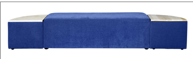
BG8501 | BG8510 | BG8501