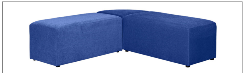
BG8509 | BG8501 | BG8509