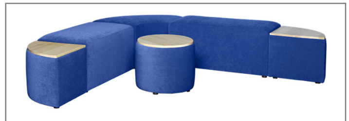
BG8501 | BG8509 | BG8508 | BG8509 | BG8501 BG8505HT