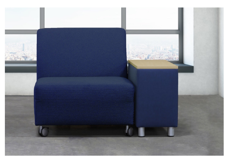
SF6200TET Chelsea Table with SF6401 Hadley Chair