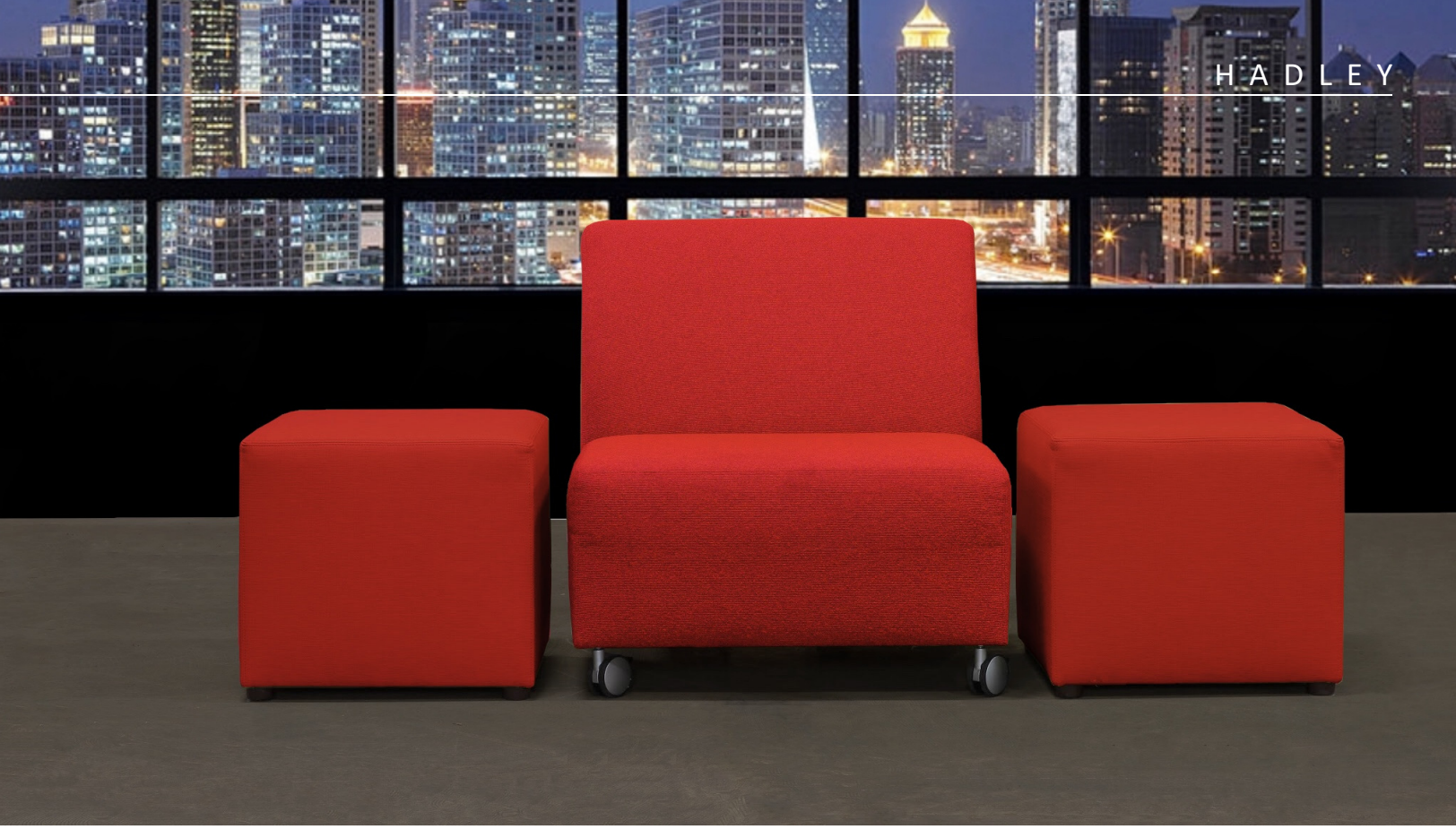
BG8502 Dalton Cubes with SF6401 Hadley Chair

Hadley's frame components are machined into puzzle like pieces on state of the art CNC equipment to within the tightest of tolerances. During the assembly process, these components lock together while commercial adhesives and mechanical fasteners are introduced to further enhance the construction. This process results in the most durable, robust and stable foundation from which to build upholstered furniture. Sinuous wire springs are added, tied together and connected to tape lined clips which prevent squeaking. This improves the longevity and overall strength. Foam is commercial grade for comfort and resiliency.